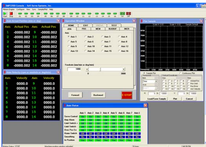
SMP3200 Console Application

Reduced hardware. Emphasizing software components and taking advantage of a computer's CPU considerably reduces hardware requirements and complex interface wiring and eliminates high-priced proprietary encoder- or servo-specific interface modules, breakout boxes, and analog and encoder cables from the PC.